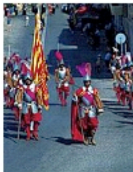
One of Malta's many festivals - celebrating 7,000 years of culture on the island of Gozo.

Feb 3 - Feb 8: Carnival Mar 10 - 13: Mediterranean Food Festival Mar 20 - 27: Holy Week May 6 - 7: Fireworks Festival July 15 - 17: Jazz Festival Sep 24 - 25: Malta International Airshow Oct 6 - Oct 16: The Malta Historic Cities Festival Oct 22 - 29: The Rolex Middle Sea Race Nov 7 - 11: International Choir Festival