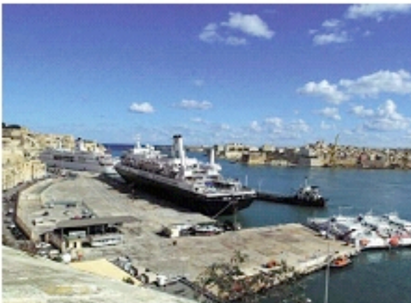
Cruise liners in the Grand Harbour of Valletta.

Phoenicians, Carthaginians and Romans left their traces, to be followed by Arabs and Normans. The Knights of the order of St John made the island their headquarters from the 16 th century and built great fortifications, palaces, public buildings and St John's Cathedral with its eight ornate chapels dedicated to each of the lingues or nations of the Order.