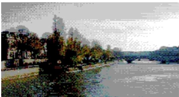
River Seine

Finding translators/interpreters: Expert Language Solutions provides quality-assured, native tongue professionals to meet your individual business needs. Get your free quote at www.expertlanguages.com .