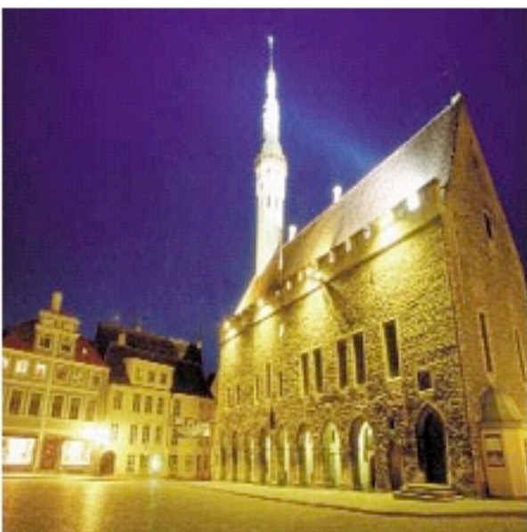
Townhall Square in the Old Town, Tallinn

Environment: 38.7% of Estonia is forested, and 10% of the country is a nature reserve. Estonia is home to several mammals and plant species that are extinct or very rare in other parts of Europe. The most numerous species of the large mammals are the roe deer, elk, and wild boar.