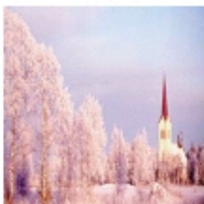
Joelaehme church 13th century

Estonia today: Estonia is the northernmost Baltic State and with a population of only 1.4 million, it is also the smallest. On 20 August 1991 Estonia re-established independence and in 1994 the last Russian troops withdrew from the country. Rapid development of the communications infrastructure followed and the capital city, Tallinn, is now particularly technologically advanced and produces half of the country's GDP. Estonia has done well since gaining independence due to its favourable location and strong Scandinavian links, particularly with Finland and Sweden. An excellent business environment and conditions for production, liberal