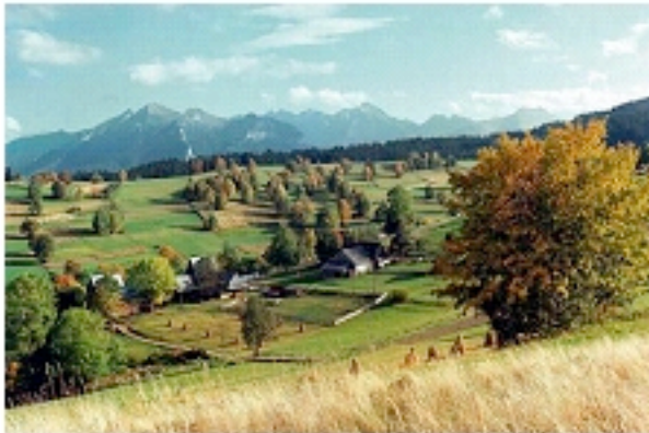
Above, countryside of the Tatra mountains near Zakopane.

Growth sectors: Automotive electronics, IT and telecoms, environment, food and food processing, infrastructure, tourism and financial services - the Warsaw Stock Exchange is now outpacing Western stock markets.