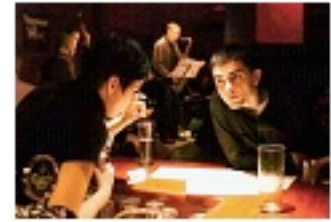
Above, guests enjoying themselves in the jazz club Tygmont in downtown Warsaw.

■ Cultured. Krakow, Poland's third largest city, has been its cultural centre since the Middle Ages. In 2000, it was the Cultural City of Europe.