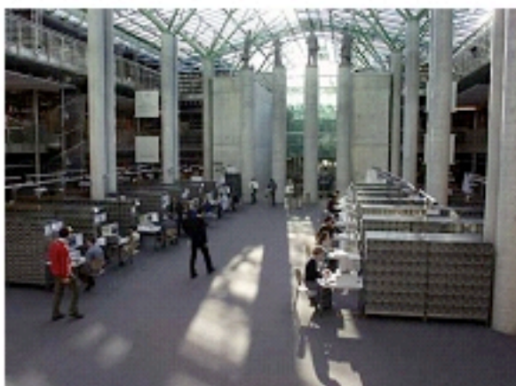
Above, view into the main hall of Warsaw's University Library.